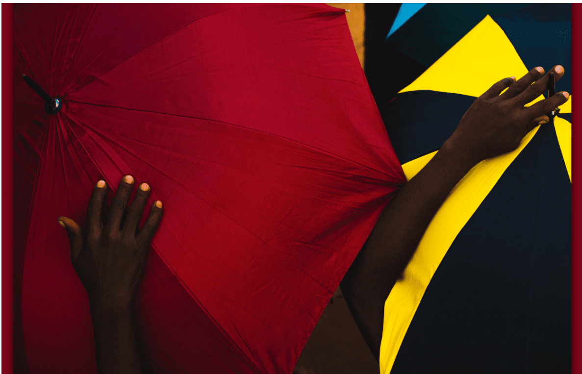
Photography: "So that we are not erased", by Obiageli Adaeze Okaro

While the African continent is still feeling the economic and social consequences of the pandemic, the process of establishing the African Continental Free Trade Area (AfCFTA) continues to make progress. The AfCFTA has numerous ambitions, including increasing intra-regional trade, promoting industrial development and creating jobs. Its operational launch in January 2021, despite the pandemic, represents a watershed moment in the history of pan-African integration. Within the present context of difficulties —although also the early stages of recovery—, the AfCFTA stands as a key instrument in the African agenda for rendering markets more competitive and furthering the continent's economic and social development.